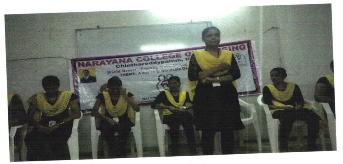
Fig:-Breast feeding week celebrations-2017