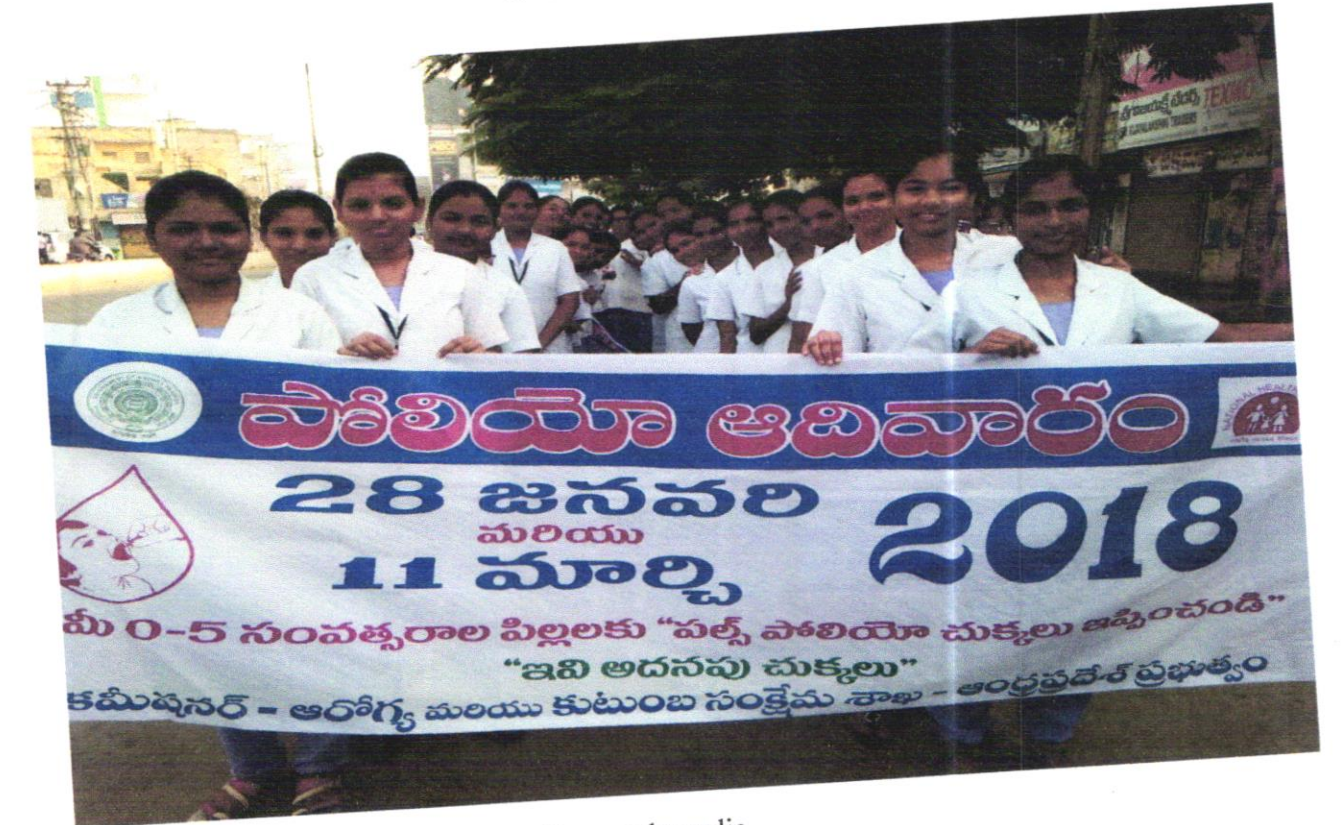
Fig: IV BSC Students M SC Students rally on pulse polie