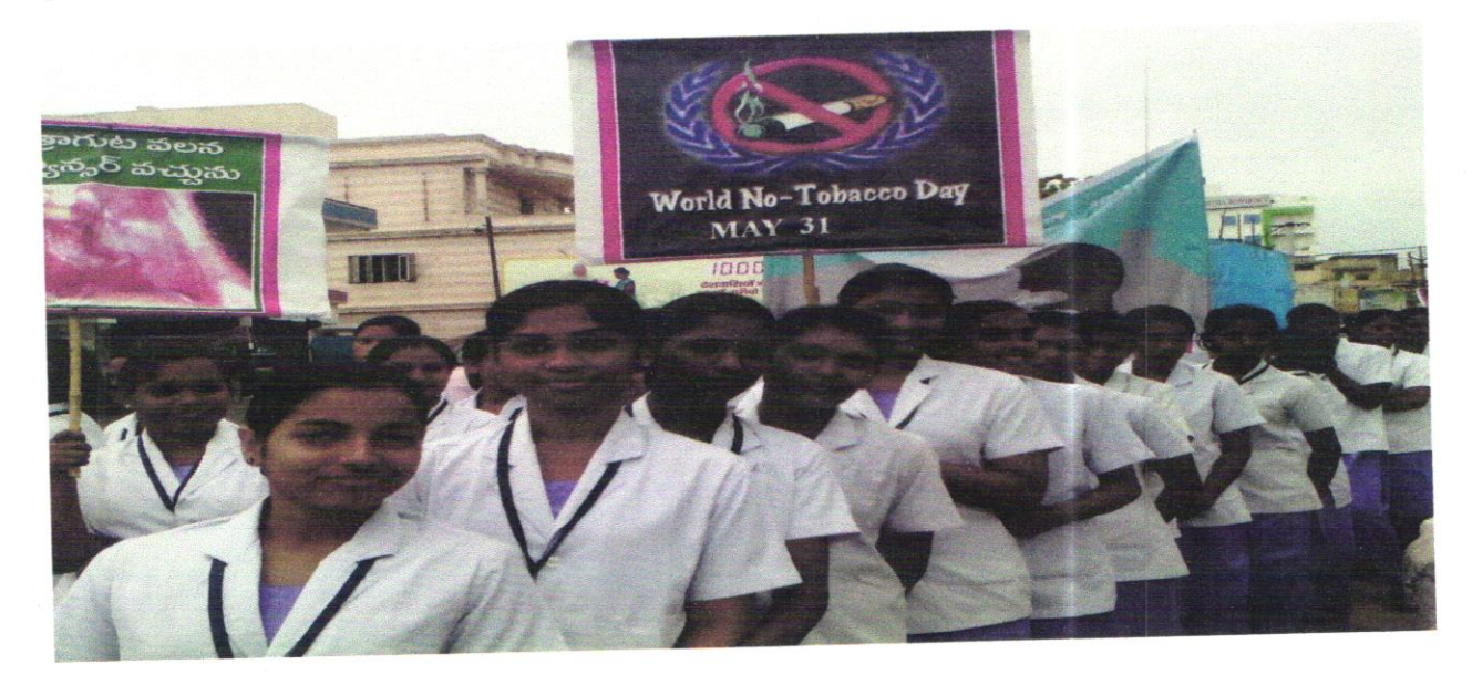
Fig: NSS team had conducted an awareness rally for No Tobacco Day.

Narayana college of Nursing created awareness on World No Tobacco Day. The function was started with rally and marked by a number of placards in Telugu outlining harmful effects of Tobacco and Oral Cancer under the guidance of NSS programme Officer.