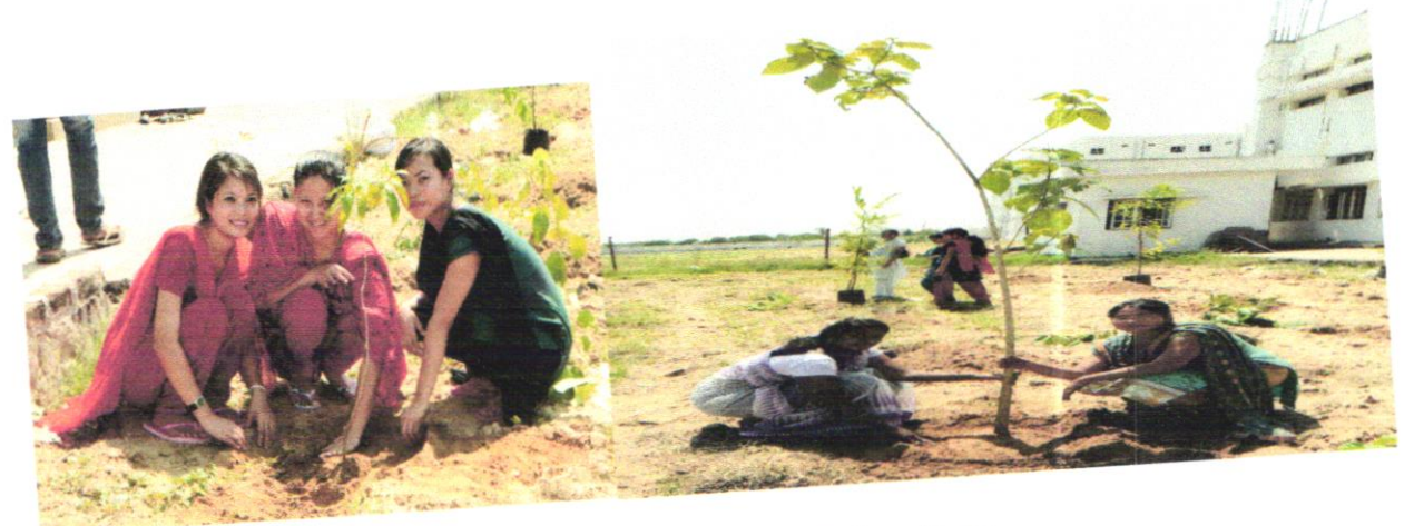
Fig 3: IVth year students planted saplings