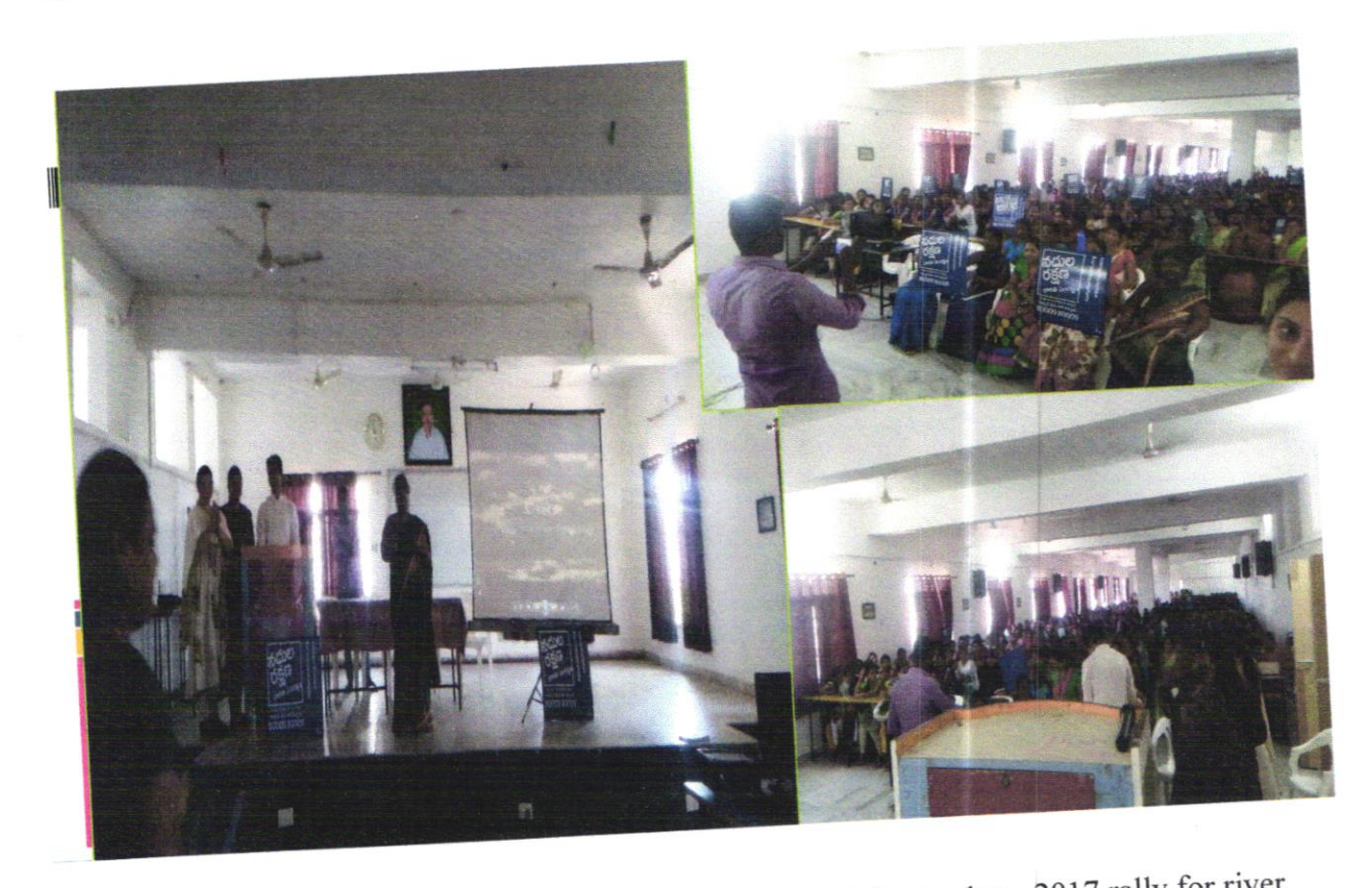
Fig: Nss team had conducted an awareness programme on 28 September 2017 rally for river

9. NSS team had conducted an awareness programme on 28 September 2017 rally for river