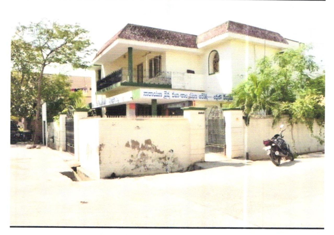
Fig: Urban Health Center Sarawathi center.

Recognized by Indian Nursing Council vide letter No. 18-916/2002/inc dated : 08.11.2002, Affiliated to NTR University of Health Sciences, A.P. Vijayawada e-mail : narayana_nursing@yahoo.co.in website : www.narayananursingcollege.com